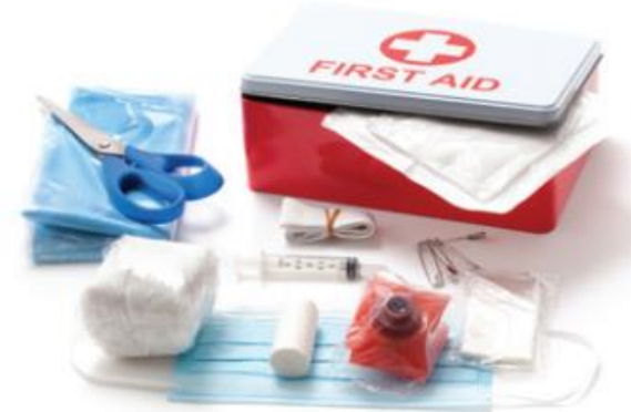
3. emergency kit