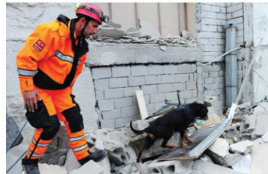
5. rescue worker