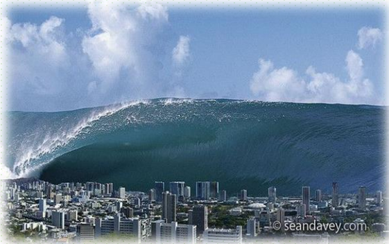
Tidal wave/ tsunami